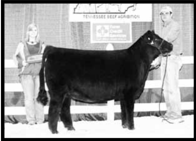
2010 Champion Sale Heifer Higgins Farms

Stock Options Marketing 6136 Black Rd West Alexandria, Ohio 45381