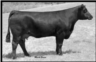
RDCA MS IMPULSE 208H 2CA dam of TR Star Struck