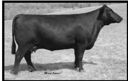
TR MS MAGIC PCA • 2003 ACA NATIONAL CHAMPION