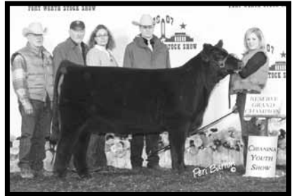
SWEET SATISFACTION 2CA • RES GRAND FT WORTH