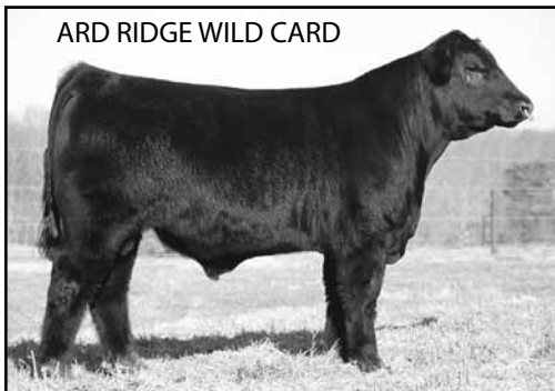
ARD RIDGE WILD CARD DAUGHTERS