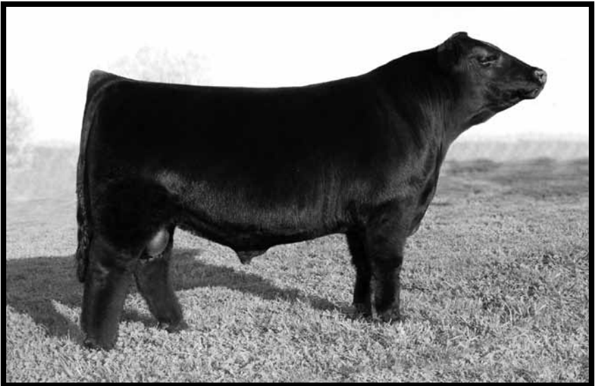
POKER FACE • SERVICE SIRE TO LOTS 16 & 17

These two Advantage flush mate daughters are going to make outstanding cows and will be producing profitable calves for a long time. Advantage daughters that are in production are doing a great job. They are both exposed to our exciting sire, Poker Face, Grand Champion at the Tennessee State Fair. 100% guaranteed! BUY WITH CONFIDENCE! Woodhaven Farm, Tn. 615.330.4195